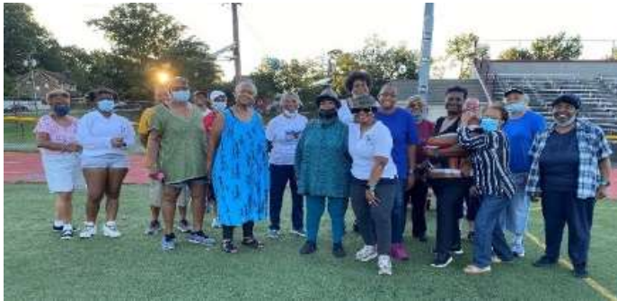
Participants of Let's Cuff It program

The responsibilities of the Public Health Nurse have increased as a result of the COVID-19 pandemic, beginning in 2020 and extending into 2021. In addition to keeping up with the routine functions and daily operations of the Health Department, responsibilities included