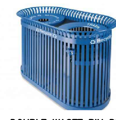
DOUBLE WASTE BIN DETAIL NTS