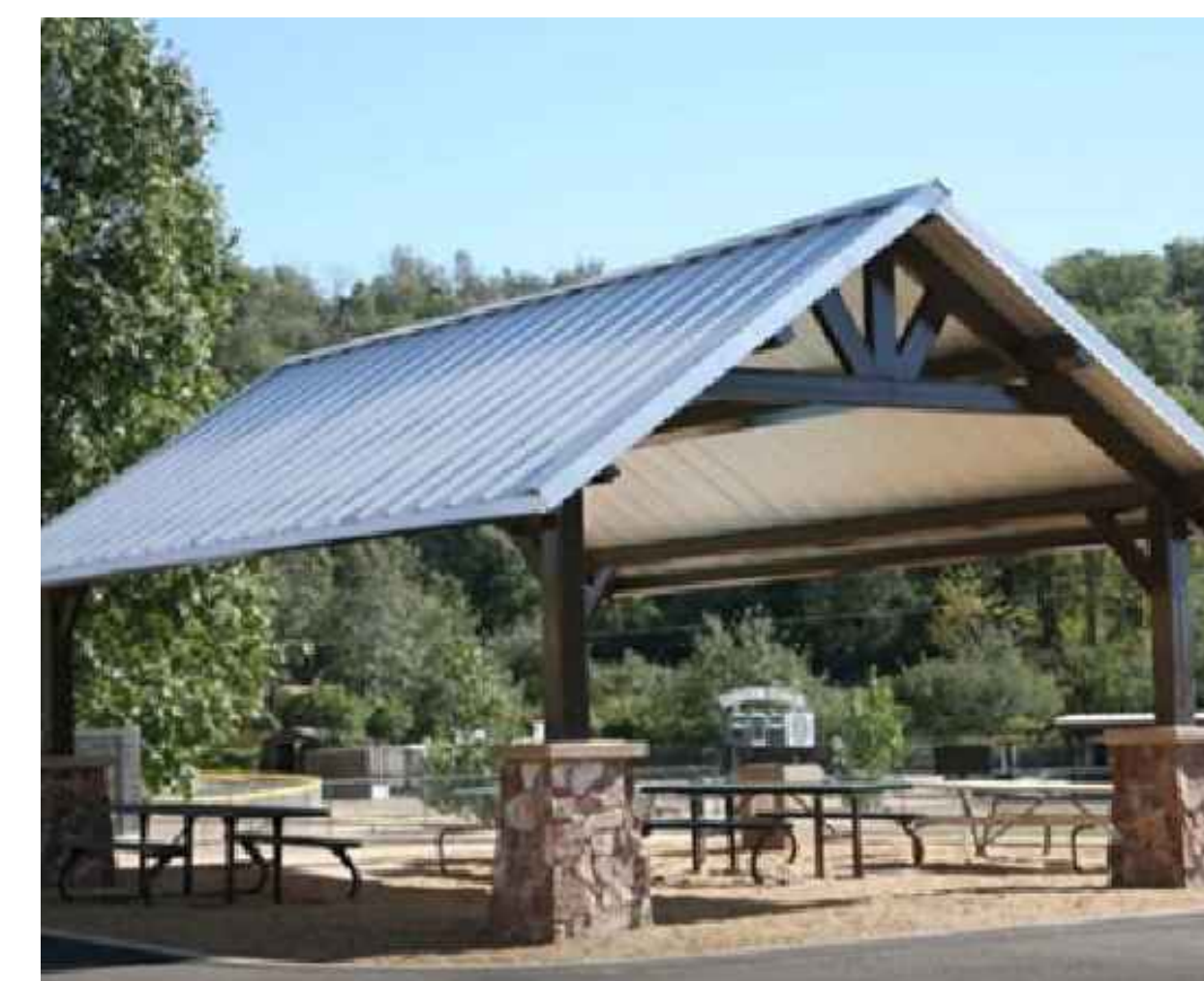
ALL STEEL HIP SHELTER (30' X 40') NTS