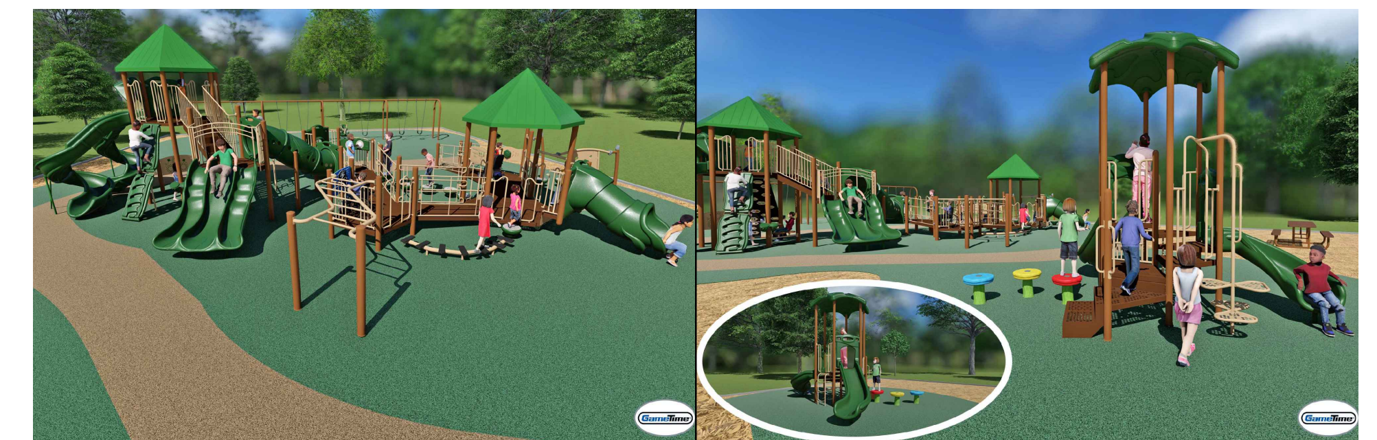
PROPOSED PLAYGROUND EQUIPMENT NTS