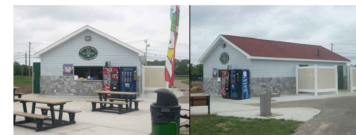
PRECAST CONCESSION/BATHROOM STRUCTURE NTS